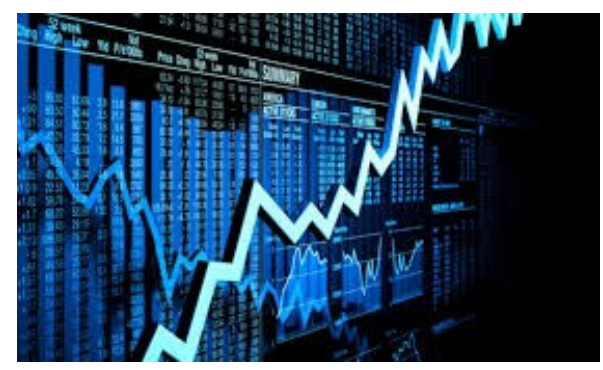
SIP is a collaboration between the Department of Economics and UCSB Extension.

The Strategic Investment Program (SIP) is designed to provide participants with a solid foundation in key practical aspects of investing and financial economics. This program is designed to give students the opportunity to gain skills and knowledge that can be directly applied in the investment arena. The certificate will also demonstrate to current and prospective employers evidence of recent professional training in this field. In some cases, course work may also be applied toward continuing education requirements in fields such as accounting, law, and finance, or other forms of career advancement.